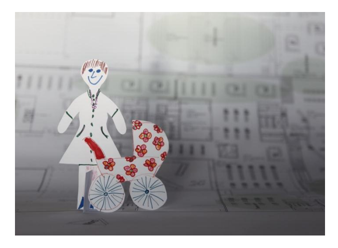
Figure 8 - A baby carriage assist the user representation

chosen to wear stilettoes, as she would like to be smart, even though she had just had her baby.