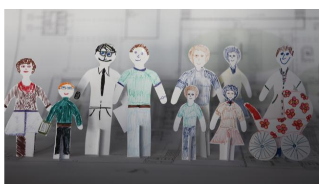
Figure 3 – Paper dolls representing users

As mentioned in the section, Research method, it occurred through the workshop, that representing users via ludo pieces in design is far from straightforward. The use of ludo pieces was limited; only two groups fleetingly used the ludo pieces by placing them on the spot of the blueprint where design discussions were centered. Predominantly, the final concept ideas mainly focused on building aspects, lacking the focus of users and use. In order to improve our understanding of how dolls can be utilised in order to represent users in design sessions, the workshop, which serves as the second case of this study, was arranged.