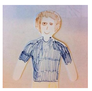
Figure 6 – Doll with a smiling face