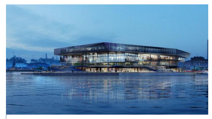
Figure 1 - Mediaspace, the future technology enhanced library

Mediaspace is the name of the future municipal library building (figure 1) which is currently under development. The library will be placed centrally at the waterfront of Aarhus, Denmark, and will link life in the city with life of the harbour area. Besides the library, Mediaspace (the building) will also include the Citizens service department and the expected amount of daily visitors is 3500, resulting in more than a million guests a year.